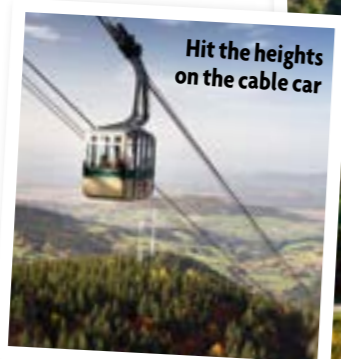
Hit the heights on the cable car

For sensational scenery and a typical Black Forest setting there's nowhere better than Freiburg's local mountain – Schauinsland. It's just a short tram and bus ride from the centre to the lower station, then a 20-minute cable car trip over the fir trees to the mountaintop where there are remarkable 360-degree views across Freiburg, the Rhine Valley and the Alps. You can gain even more height by climbing the 31m viewing tower. Have a bite to eat on the sun terrace of the Bergstation cafe and restaurant – the views from here are only surpassed by the generous portions of Black Forest Gateau.