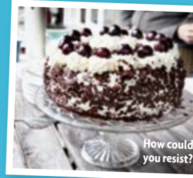
How could you resist?

You'll find versions of it in most cafes and bakeries here, but for a particularly elegant cake break it has to be Cafe Graf Anton at Colombi Hotel.