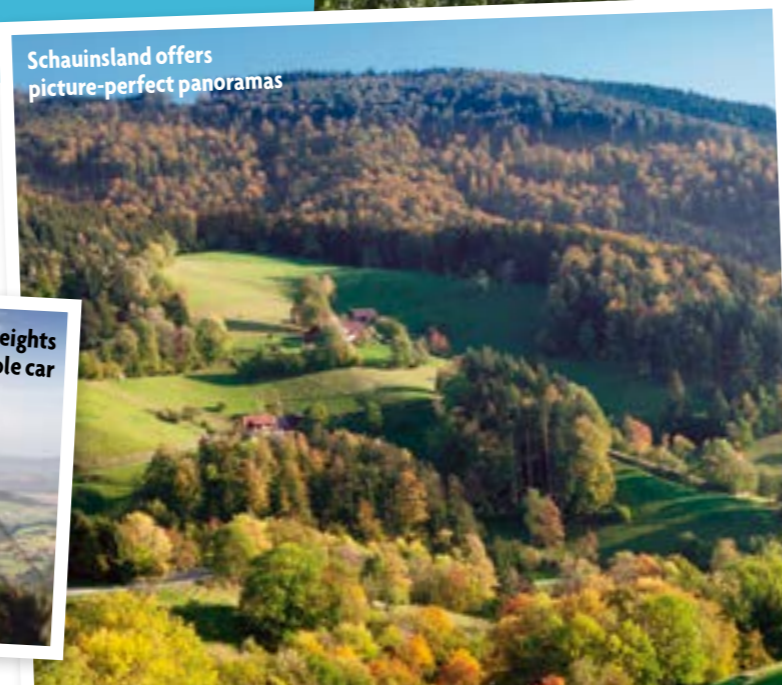
Schauinsland offers picture-perfect panoramas