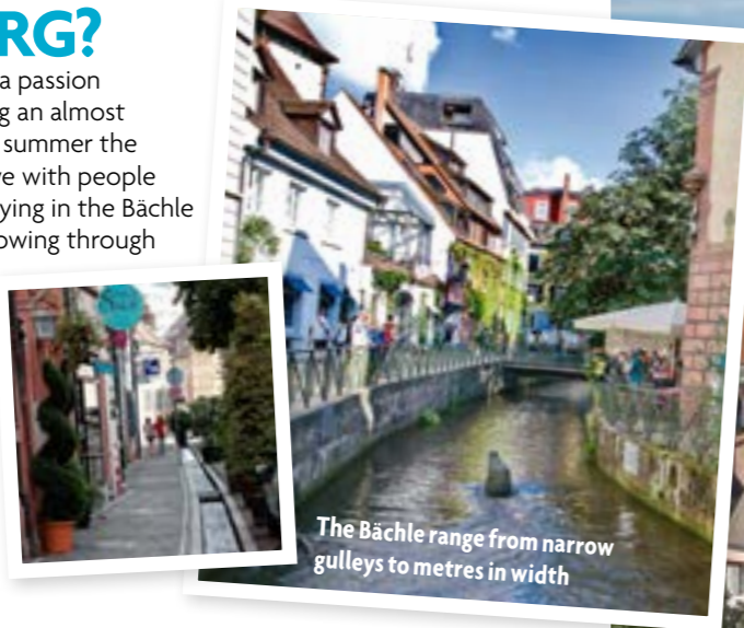
The Bächle range from narrow gulleys to metres in width

The warm weather coupled with a passion for good, local food gives Freiburg an almost Mediterranean feel. In spring and summer the pretty cobbled squares come alive with people eating, drinking, shopping and playing in the Bächle – a network of narrow streams flowing through the streets. Take note, though, local legend says that unmarried visitors who step in the Bächle must return and wed a Freiburger. The city is also a perfect base for exploring the beautiful Black Forest. In fact, you can find yourself within the forest in a matter of minutes by walking up Schlossberg, a wooded hill beside the city centre.