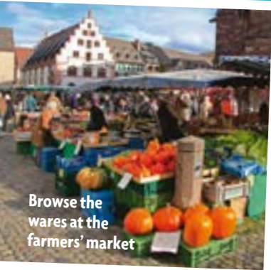
Browse the wares at the farmers' market

The best way to find your bearings is with a guided city tour. Cittalino is a little local company offering a fun and fascinating insight. Tours usually take in the handsome old and new town halls on Rathausplatz and impressive cathedral on Münsterplatz. Don't miss the open-air farmers' market. It surrounds the cathedral every day except Sunday, but is at its liveliest on Saturdays when the fresh fruit and veg, breads, teas, spices and hot sausages fill the square with scent and colour. Do as the locals do and shop while munching on butter pretzels or a lange rote – Freiburg's famous red wurst.