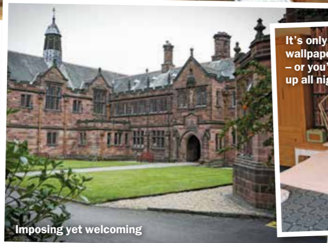
Imposing yet welcoming

The rustic simplicity of farm life has the hygge factor, and at Huntstile organic family farm near Bridgwater in Somerset you can experience the good life. Resident chickens, goats,