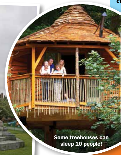
Some treehouses can sleep 10 people!

Spending quality time with family and friends is what hygge is all about. Book a Golden Oak treehouse cabin with Forest Holidays and up to 10 of you can holiday together in a tranquil tree-covered setting. The treehouse cabins are at six woodland locations around the country and include simple, cosy luxuries like a log-burning stove, snugly bathrobes and an open-air terrace for whiling away lazy afternoons. The highlights are the treehouse bedroom and an outdoor hot tub where you can relax the Scandinavian way, leaning back in the warm water beneath a star-studded night sky. For prices, visit www.forestholidays.co.uk