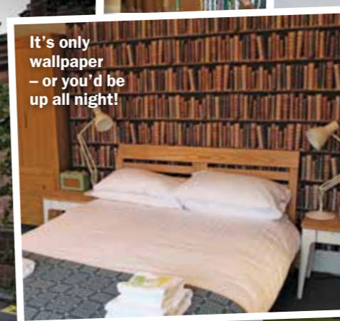
It's only wallpaper – or you'd be up all night!