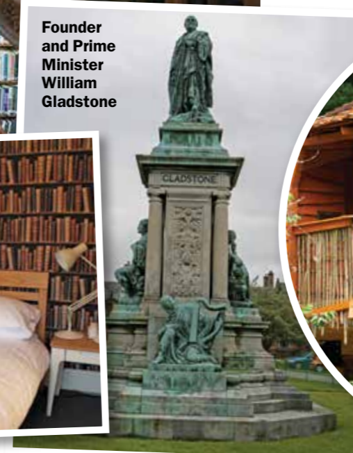
Founder and Prime Minister William Gladstone

To really go big on hygge, stay in the farm's prettily painted gypsy caravan. It's a tiny romantic hideaway