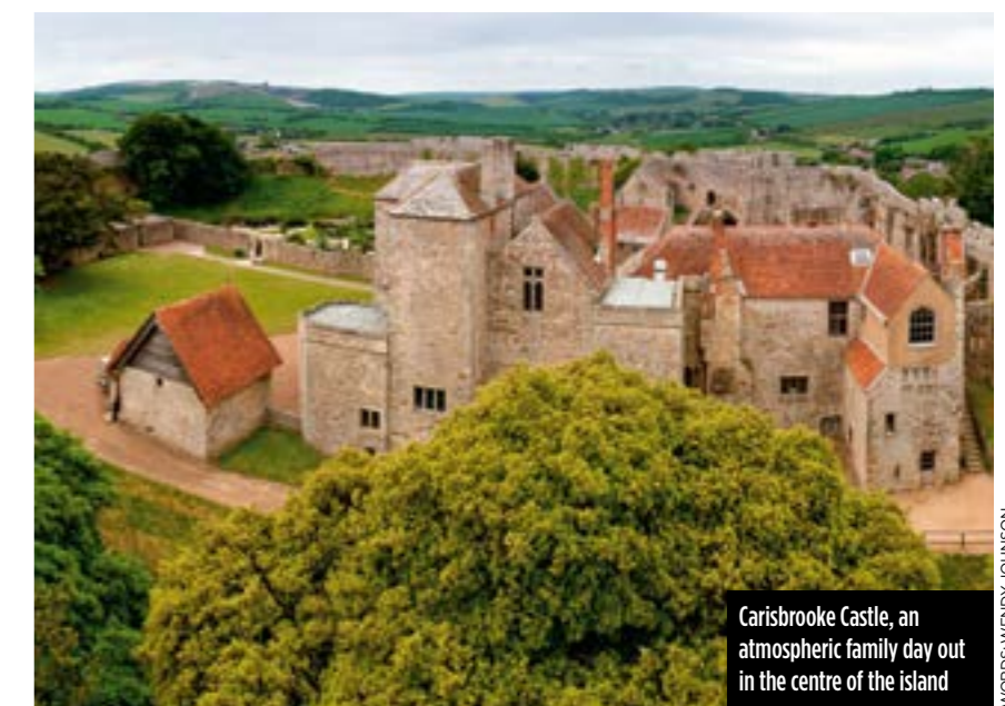
Carisbrooke Castle, an atmospheric family day out in the centre of the island

For ideas about activities, events, places to visit, stay and eat, visit visitisleofwight.co.uk