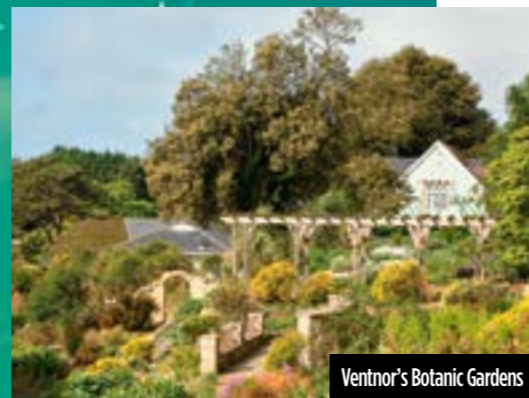
Ventnor's Botanic Gardens

name the best place to eat on the island, however, and they'll tell you to try The Hambrough in Ventnor. The food is sublime (£45 for three courses – see thehambrough.com ). Sipping a Singapore sling in the bar and eating in the intimate candlelit dining room where turquoise sea views fill the windows was an experience I felt sure even the Med couldn't match.